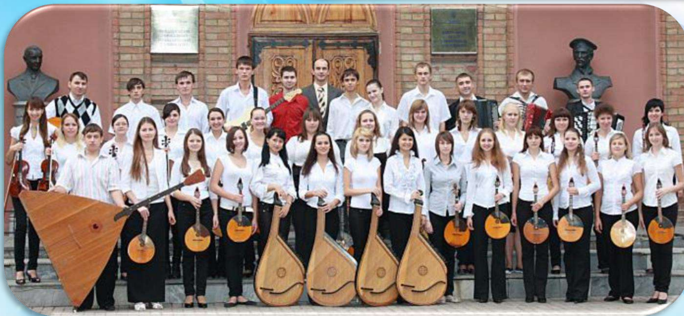
Orchestra of Folk Instruments