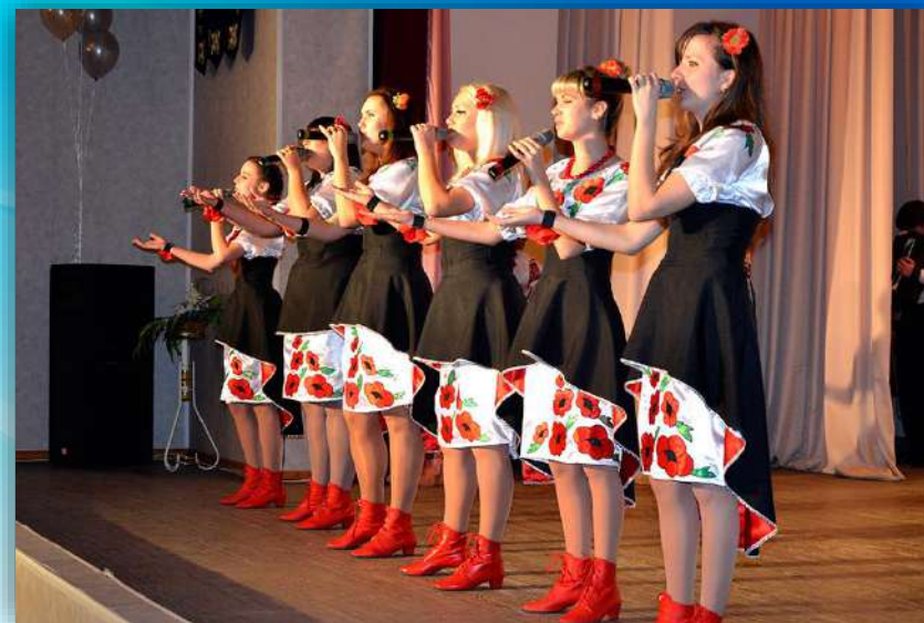
Vocal ensemble "Fairy"