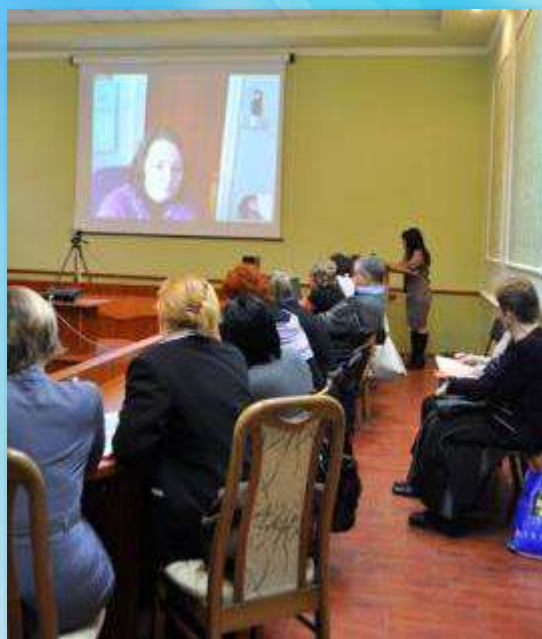
Online lectures of professor Olga Bogdashina on autism (January, 2013)

Online conference «QUEERING SPACES / QUEERING BORDERS» between University of North Carolina (USA) and BSPU (April, 2013)