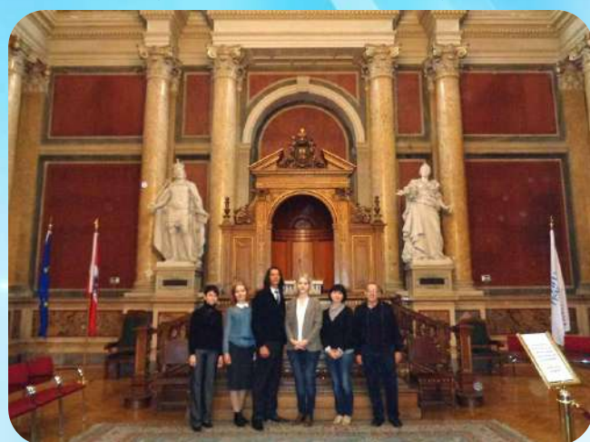
Internship at the University of Vienna (October, 2014)