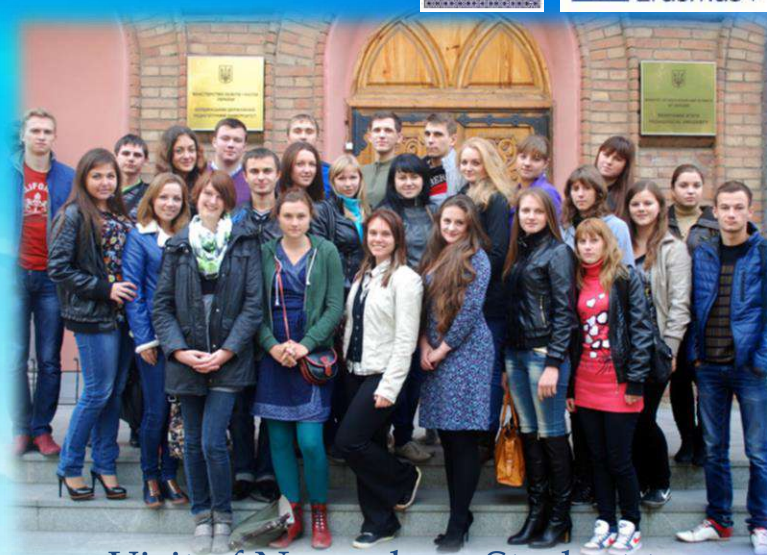
Visit of Nuremberg Student to BSPU (September, 2013)