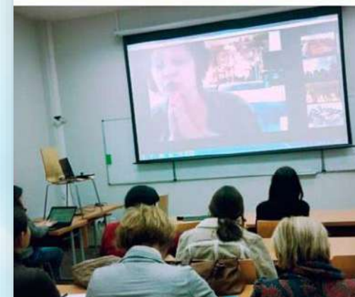
Training teleconference in Lviv - New York - Kyiv - Berdiansk (March, 2015)