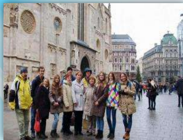
Teachers and students of BSPU at the international conference in Poland (2015)