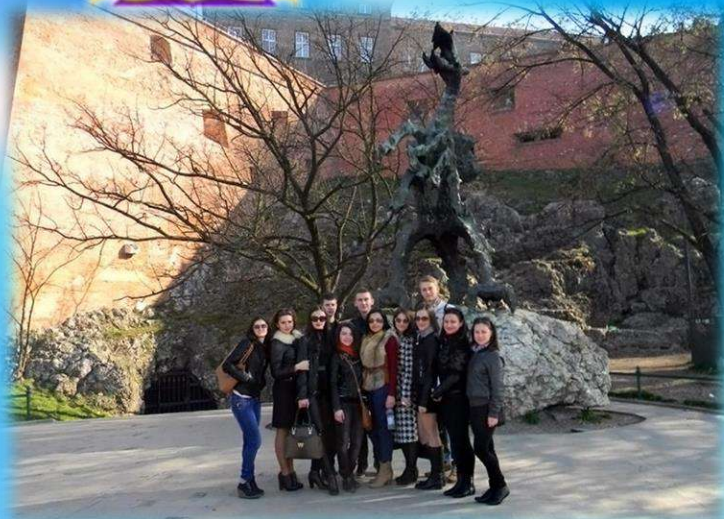
Students of BSPU at the II International Festival and Competition «MYSTERY OF KRAKOW» in Krakow (Poland)