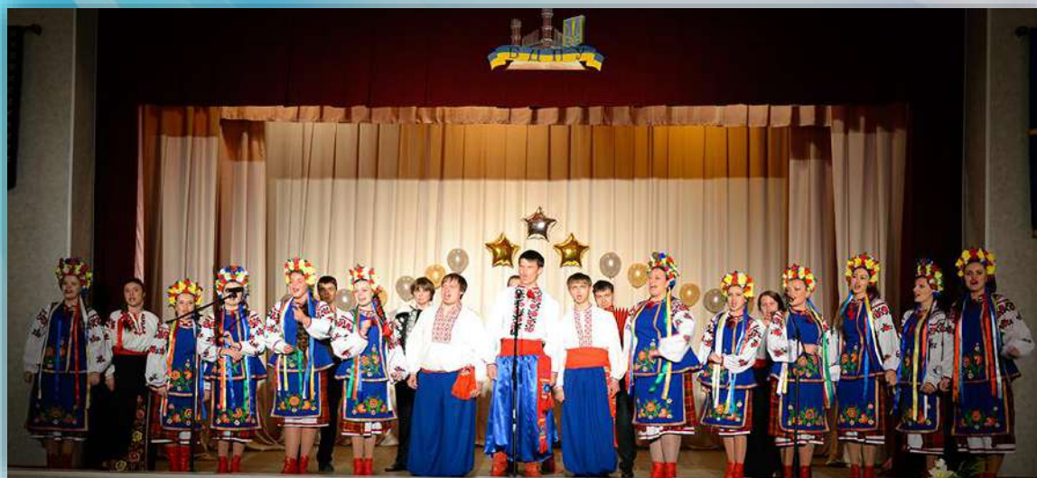
Folk Ensemble «Zolotiy gomin»