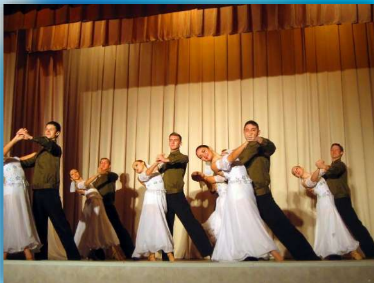
Folk Ensemble of variety dance «Marlene»